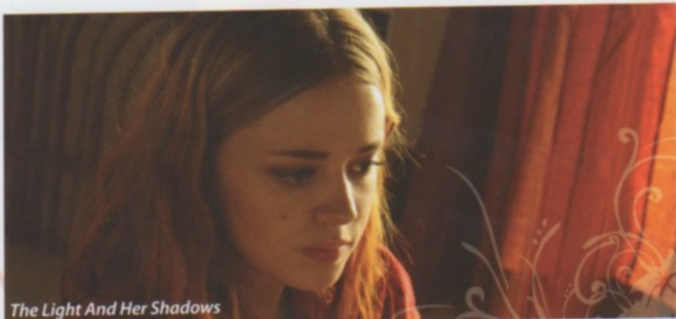
The Light And Her Shadows